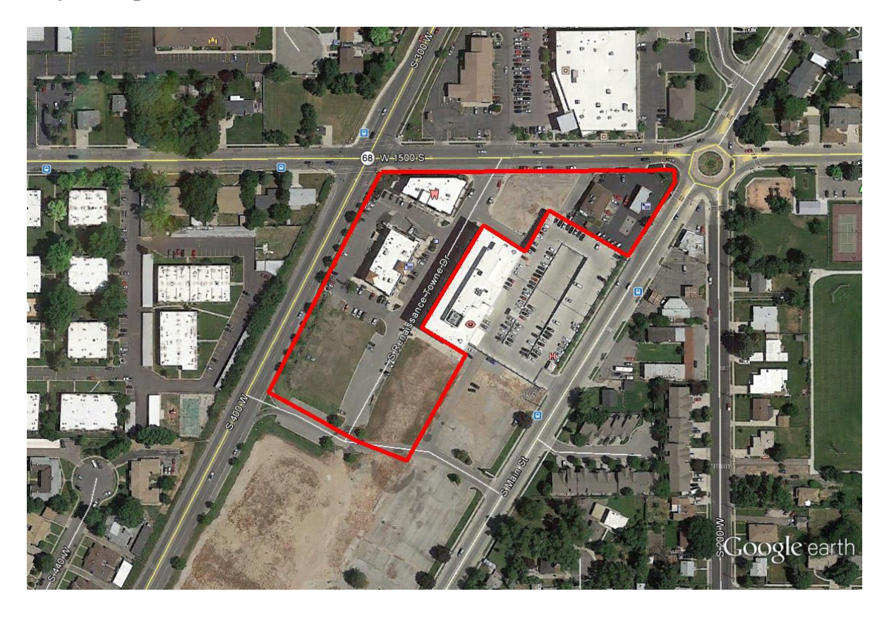
Subject Properties — 1520 S Main and 1512, 1560, & 1580 S Renaissance Towne Center