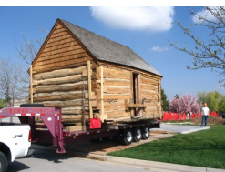
Above: April 2005 move Below: Foundation at new location north of City Hall.

The BHPF's annual summer historical tours around the city will take