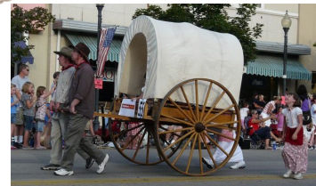
Junior High, 955 East 1800 South.

Park activities include pioneer games and many other fun things for children. Schedule a mini-vacation for your family and join the celebration at the park to enjoy this great community tradition! Find more details at www.handcartdays.org .