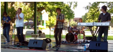
Argyle Band from the 2012 Concerts in the Park Series