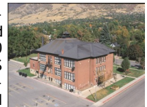
Aerial view of Stoker School today.

Probably everyone in Bountiful knows that Stoker Elementary School (now the University of Utah Bountiful extension) was one of the area's earliest schools. But did you know that in the 1850s, an even earlier school was built on the corner of 500 North and 200 West? Made from adobe brick, the building served as a school, an LDS Sunday School meetinghouse, and a town hall. In conjunction with the 100th Anniversary of the Davis County School District, an historical marker will soon be installed near the site of the Adobe School. Stay tuned for more details.