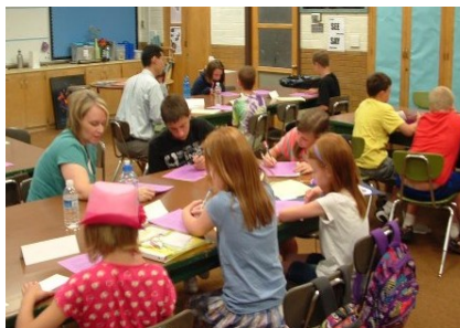
Students enrolled in the summer academic program at South Davis Junior High