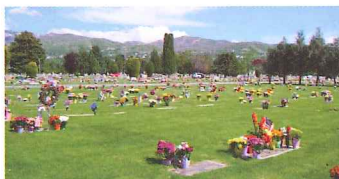
Memorial Day 2009

not deliver flowers or decorations to the cemetery prior to Thursday of that week.