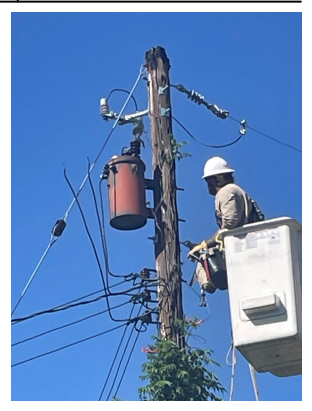
The Bountiful City Light & Power Department employees as a group and fixing power outages at all hours!

Bountiful City Hall • 795 South Main Street • 801.298.6140 info@bountiful.gov • www.bountifulutah.gov • Monday-Thursday 7:00 a.m. to 6:00 p.m.