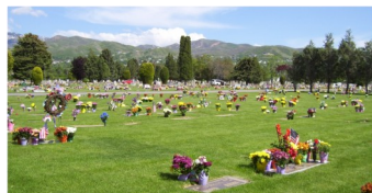
Memorial Day 2009

manicuring of the cemetery, all ground-level flowers and decorations will be cleaned up. Please do not deliver flowers or decorations to the cemetery prior to Thursday, May 26th.