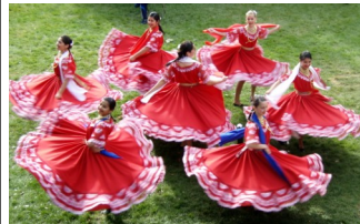
Performing group from Paraguay who participated in Summerfest 2010