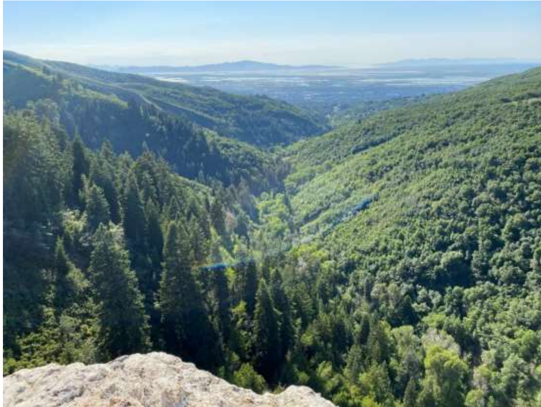
Figure 1 Mueller Park from Big Rock