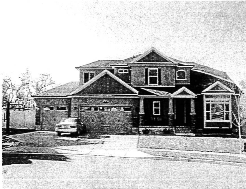
FRONT (NORTH SIDE)

If using the Elevation Certificate to obtain NFIP flood insurance, affix at least 2 building photographs below according to the instructions for Item A6. Identify all photographs with date taken; "Front View" and "Rear View"; and, if required, "Right Side View" and "Left Side View." When applicable, photographs must show the foundation with representative examples of the flood openings or vents, as indicated in Section A8. If submitting more photographs than will fit on this page, use the Continuation Page.