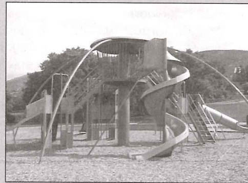
1300 East Park? Rocket Park?

(BCSC) has launched a public service campaign to officially name ten Bountiful City parks. Several names