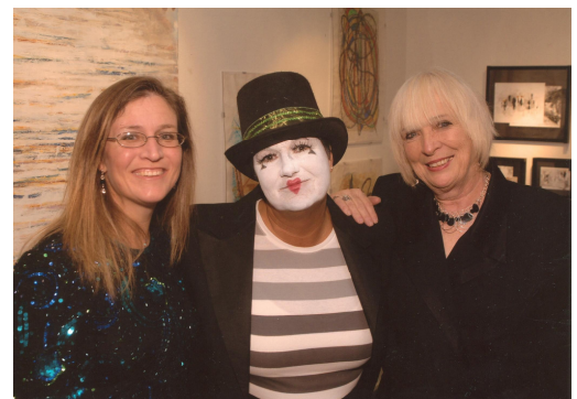
Evening in the Art 2009

For more or updated information, visit our website at www.bdac.org or call 801.292.0367.