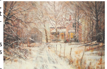
Winter Color By Larry Winborg Oil on canvas

BDAC is located at 28 East State Street Farmington, UT 84025. South Door, 2 nd Floor - Contact: (801) 451-3660 or info@bdac.org .