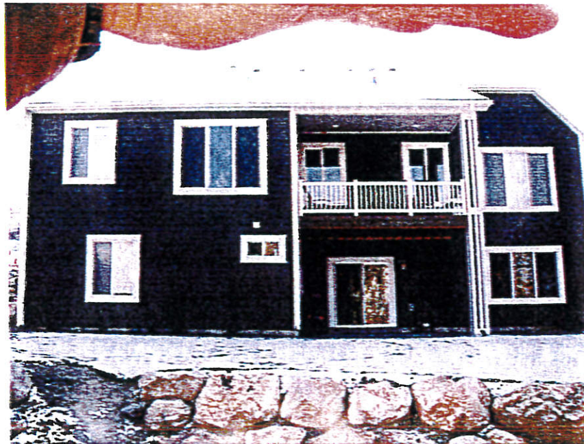
REAR (NORTH SIDE)