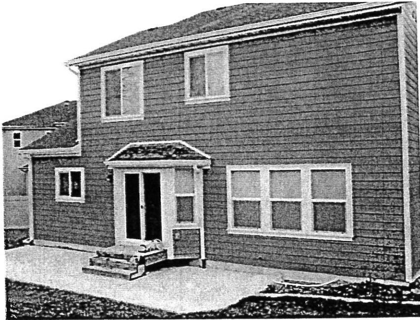
REAR (SOUTH SIDE, 1 OF 2)

If submitting more photographs than will fit on the preceding page, affix the additional photographs below. Identify all photographs with: date taken; "Front View" and "Rear View"; and, if required, "Right Side View" and "Left Side View." When applicable, photographs must show the foundation with representative examples of the flood openings or vents, as indicated in Section A8.