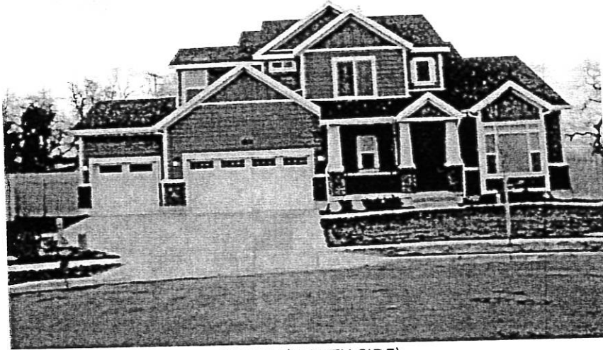
FRONT (NORTH SIDE)

If using the Elevation Certificate to obtain NFIP flood insurance, affix at least 2 building photographs below according to the instructions for Item A6. Identify all photographs with date taken; "Front View" and "Rear View"; and, if required, "Right Side View" and "Left Side View." When applicable, photographs must show the foundation with representative examples of the flood openings or vents, as indicated in Section A8. If submitting more photographs than will fit on this page, use the Continuation Page.